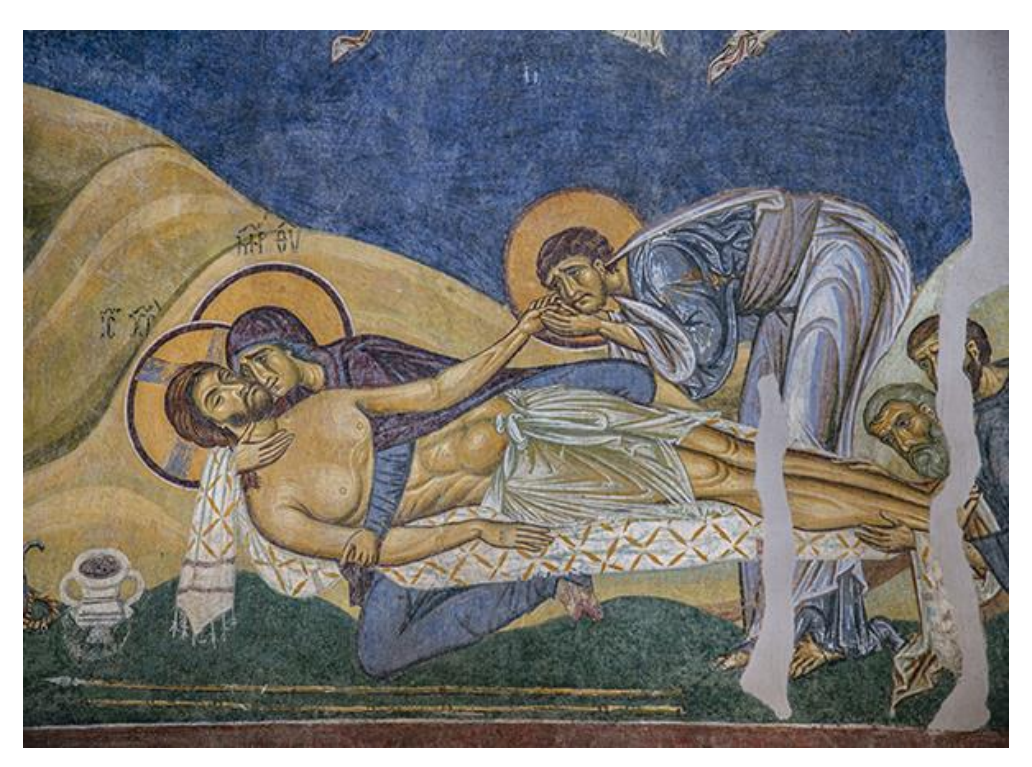
Church of Saint Panteleimon, 1164, Nerezi, North Macedonia